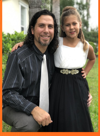
Daddy Daughter Dance!