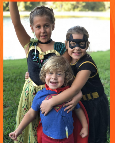
All Dressed up for Halloween!