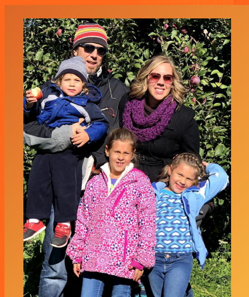
Bringing Hope and Healing through Christ to Men and their families to find FREEDOM from addiction and to THRIVE in LIFE